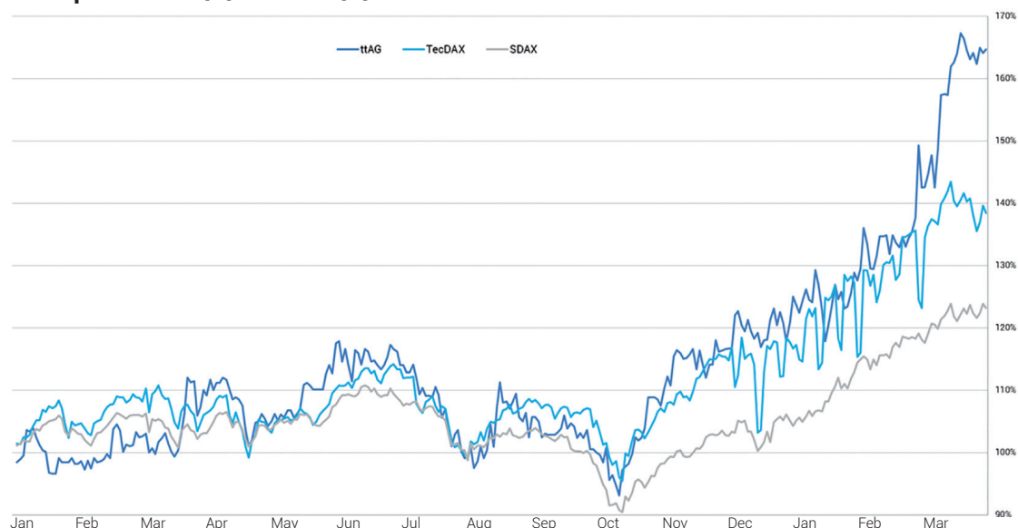
Chart development from 1/1/2014 to 31/3/2015

At March 31, 2015 the trading price of € 12.70 was around 37 percent up on the 2014 year-end price (€ 9.28). The rally initially continued into April and the share price reached a new high of more than € 14. The general mood on the stock market and the positive attention that technotrans was attracting provided a further lift to the trading price, in particular after the publication of the Annual Report on the past year of 2014. The dialogue with institutional investors at roadshows was stepped up and interest has grown noticeably. At present the analysts' price targets for technotrans shares range between € 14.00 and € 19.00, and without exception represent "buy" recommendations.